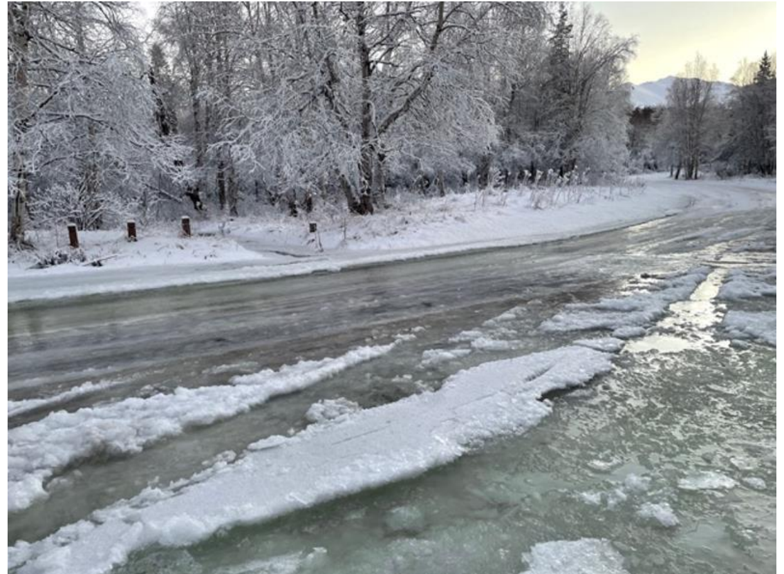
Flooding on Campbell Airstrip Road