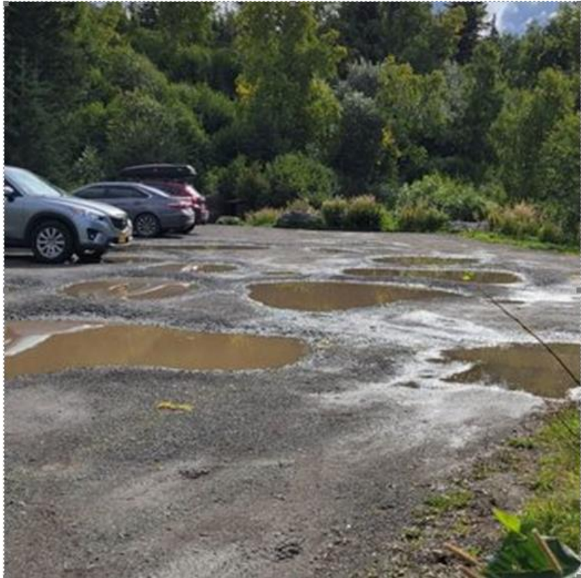
Basher Trailhead Parking