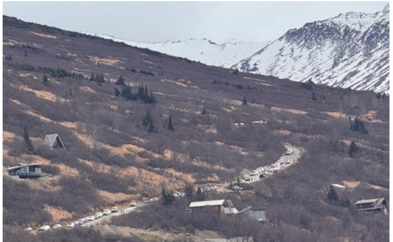
Sunnyside Trail Access, with parking along main road