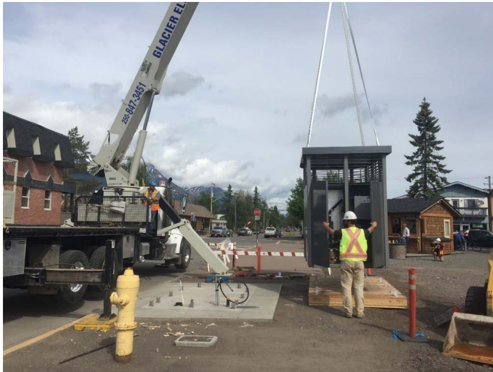
Installation, July 2017

The loo comes with a counter but the counter is unreliable (it is triggered by the motion detector), and we have not used it or done any other investigation as to how often the loo gets used, so its hard to make any meaningful statements regarding amount of use.